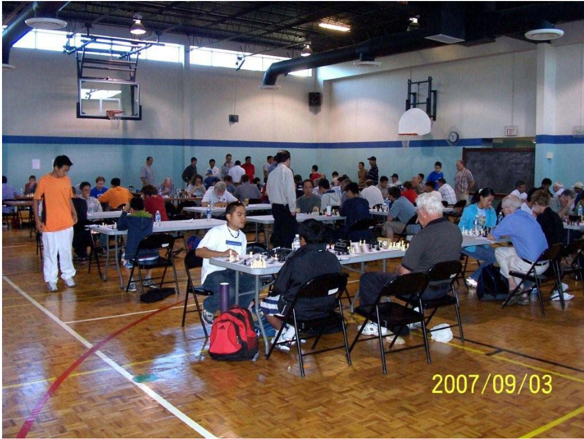
The new location of the Toronto Labour Day